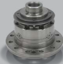
PN. 168PL07 (ROVER TYPE)

Experiencing life outdoors is best achieved behind the wheel of a 4WD. But, why is it when you finally take your 4WD out of suburbia onto what's meant to be its home-turf that even the smallest obstacle becomes too challenging for your brand new, shiny 4WD? Well, it's all about traction. Traction describes the relationship or grip that your tyres have with the ground, and loss of traction is the 4WD's number one enemy. Without traction, your prized 4WD will be about as useful as an exercise bike at a suburban gym.