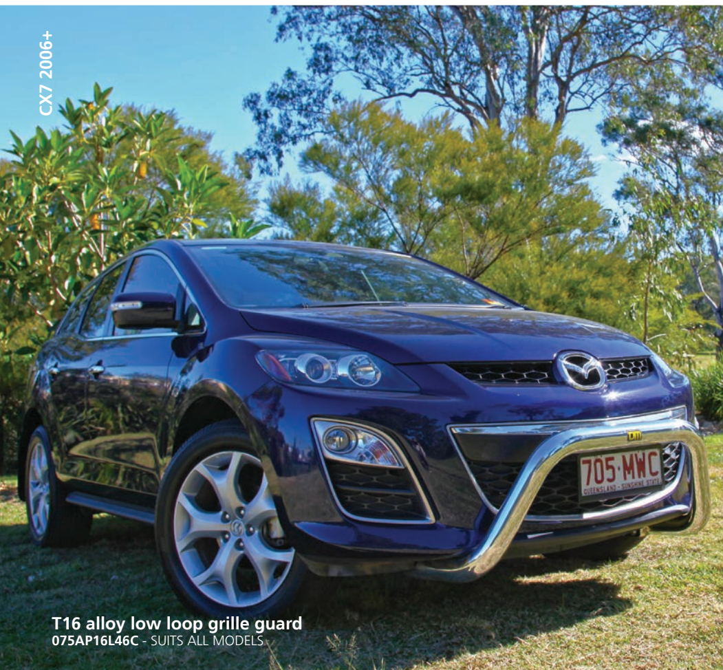
T16 alloy low loop grille guard 075AP16L46C - SUITS ALL MODELS