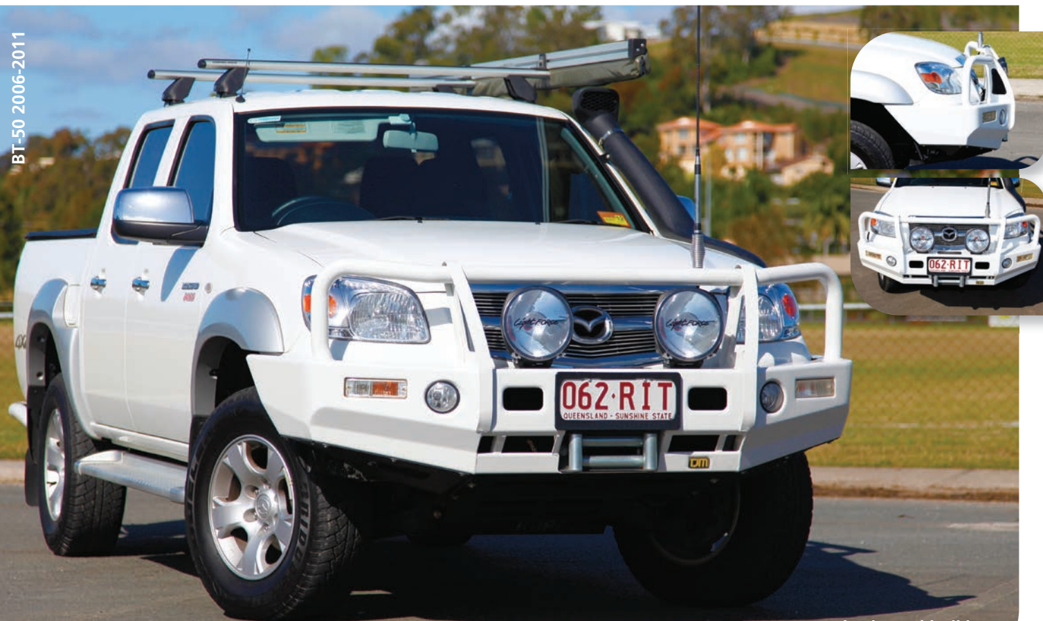
T13 Outback steel bull bar

070SB13N46Z - SUITS 2006-2011 PETROL & DIESEL MODELS