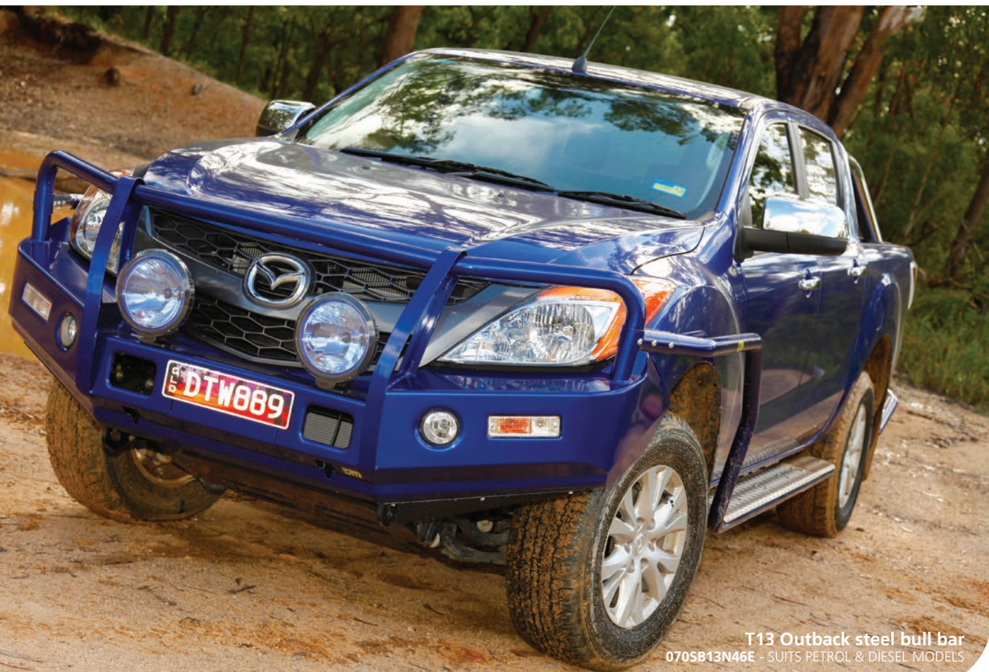
T13 Outback steel bull bar 070SB13N46E - SUITS PETROL & DIESEL MODELS