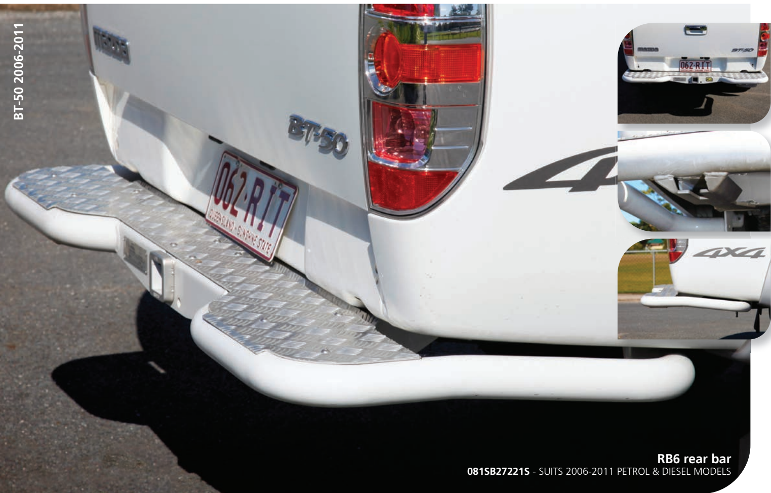
RB6 rear bar

081SB27221S - SUITS 2006-2011 PETROL & DIESEL MODELS