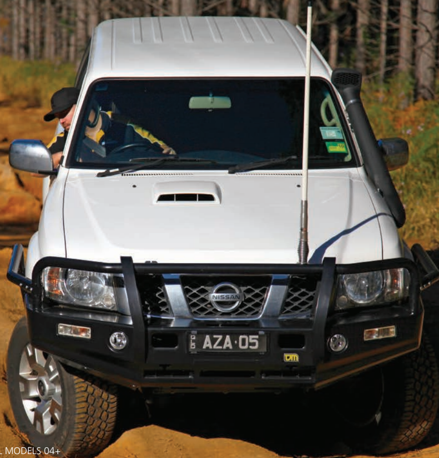
T13 Outback steel bull bar 070SB13L13W - SUITS PETROL & DIESEL MODELS 04+