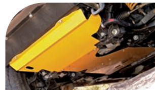
D40 NAVARA & R51 PATHFINDER Front underbody guard & sump guard*