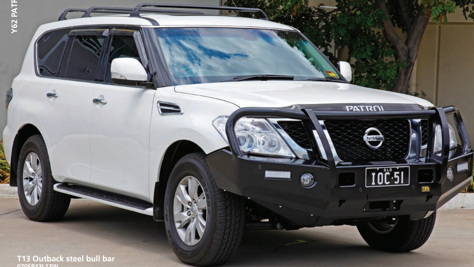
T13 Outback steel bull bar 070SB13L13W