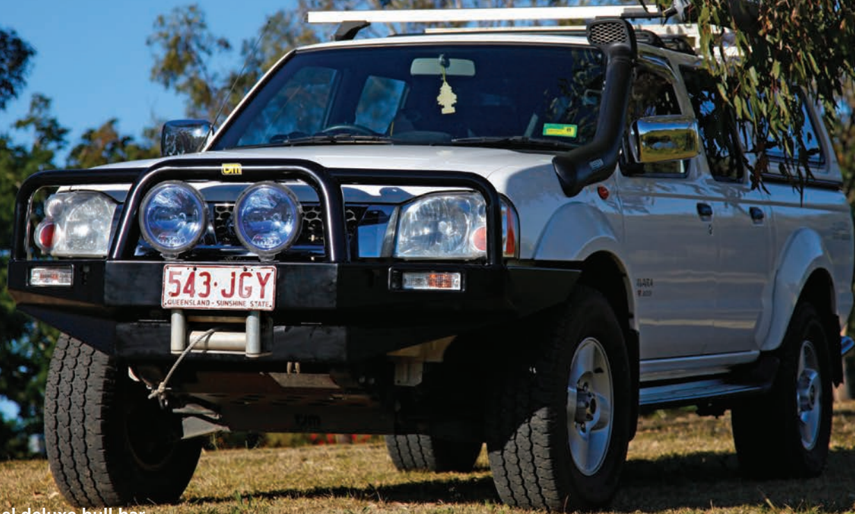
T15 steel deluxe bull bar 070SB15N090 - SUITS PETROL & DIESEL MODELS 01+