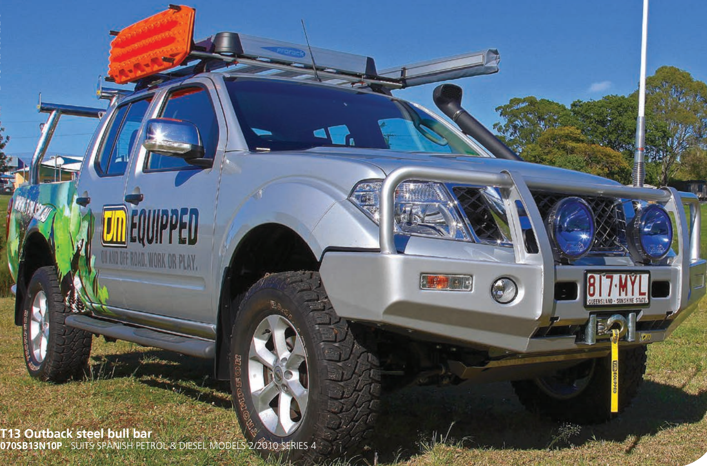
T13 Outback steel bull bar 070SB13N10P - SUITS SPANISH PETROL & DIESEL MODELS 2/2010 SERIES 4