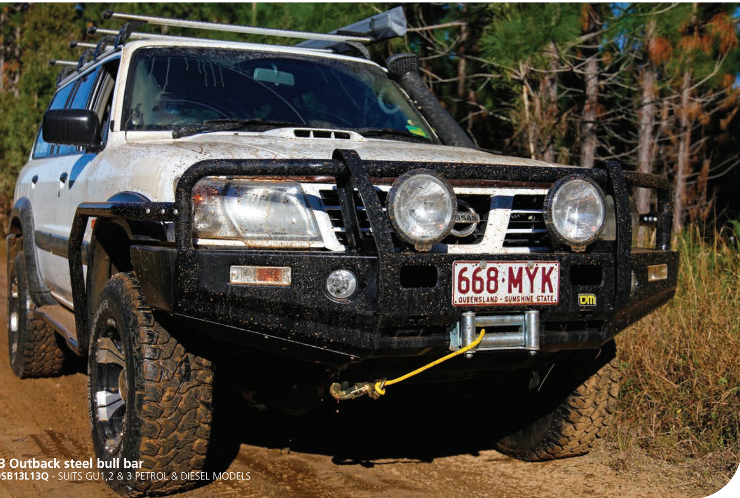
T13 Outback steel bull bar 070SB13L13Q - SUITS GU1, 2 & 3 PETROL & DIESEL MODELS