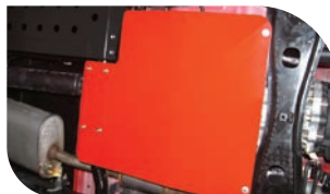
GU4 PATROL - Transmission guard*